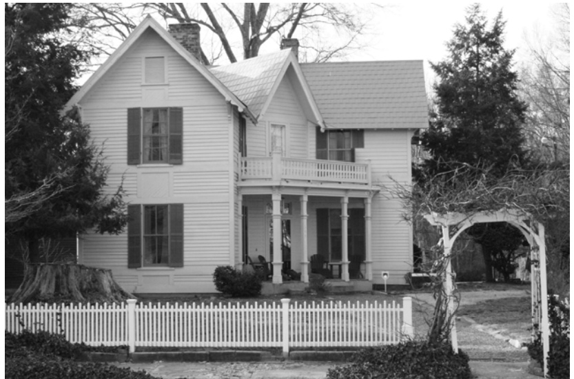
The Potts House

Potts Street was originally part of South Main Street. Prior to the 1920s, the section of South Main Street that proceeds down the hill from Walnut Street and under the RR overpass did not exist. In order to follow South Main Street towards Cornelius, it was necessary to take a sharp right turn just south of what is now the DUMC Youth House, head west across the railroad tracks and then south along what is now Potts Street. When South Main Street was straightened in the 1920s, the street was renamed for the Potts family who lived for many years in one of the oldest homes on the street.