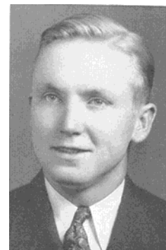
T. Watson Street